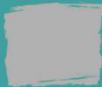
Goose Grey (BS00 A05)