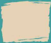
Light Ivory (RAL 1015)

Below are popular product colours. Please note all grilles are quoted in Traffic White as standard. If you require any of our other colours below, or a completely different colour, additional charges will apply.