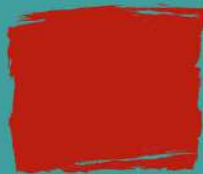
Traffic Red (RAL 3020)