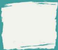
Traffic White (RAL 9016)