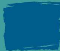
Traffic Blue (RAL 5017)