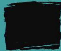
Jet Black (RAL 9005)